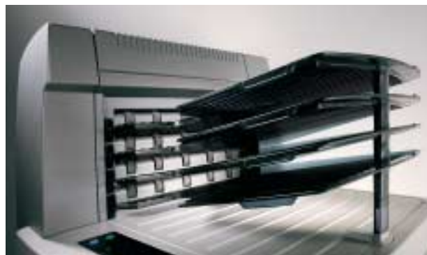
Unique sorter eliminates high-traffic bottlenecks