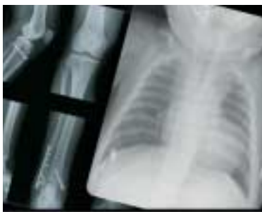
High resolution of 508 ppi