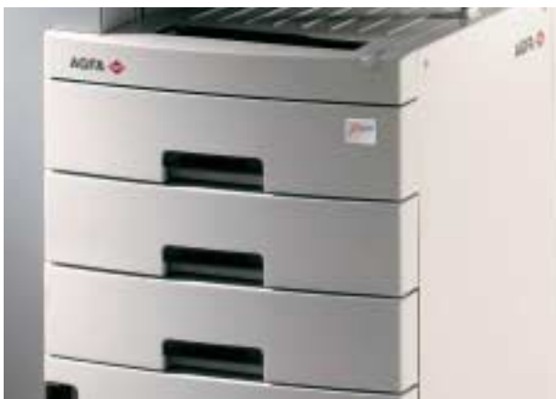
Three media trays for different on-line media sizes

DRYSTAR 5503 features multiple-format handling, with the three most popular media sizes and/or types permanently on-line. The imager is thus capable of delivering CT, MRI, DSA, digital R&F, CR and DR images at high speed onto different DRYSTAR DT2 media. The DRYSTAR 5503 comes with three input trays. Every input tray can use five different film formats, ranging from 8 x 10" to 14 x 17", making the final image versatility of this stand-alone, small footprint unit remarkable. And what DRYSTAR 5503 gains in versatility, the user gains in convenience and time.