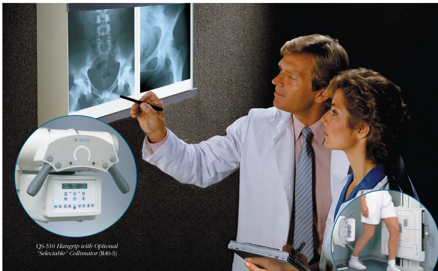
QS-510 Hangrip with Optional "Selectable" Collimator (R40-S)

An exclusive worldwide dealer network provides factory-authorized sales and service for all Quantum Medical Imaging systems. These authorized Dealer representatives are members of Quantum's Gold Star Network, an affiliation of select professionals around the world who have been recognized for excellence in technical support and customer service.